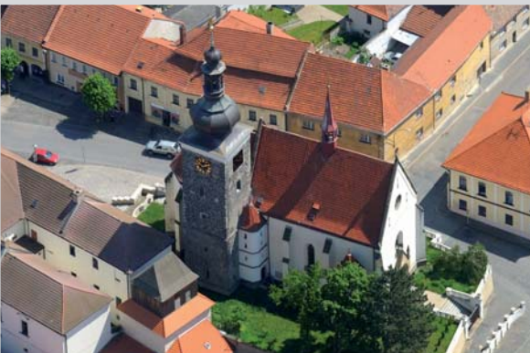
Velvary, The Church of St. Catherine