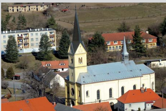
Dolní Hbity, The Church of St. John the Baptist