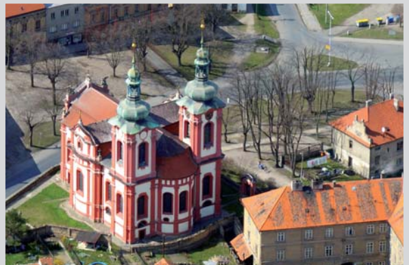
Zlonice, The Church of Virgin Mary's Assumption