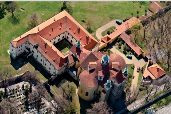
Slaný, The Monastic Church of Holy Trinity