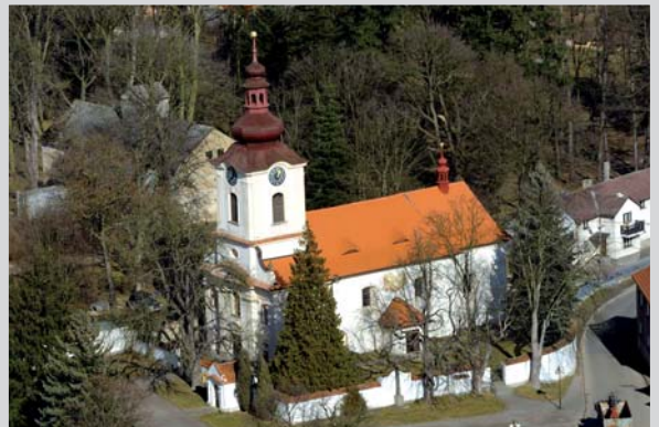
Petrovice, St. Peter and St. Paul's Church