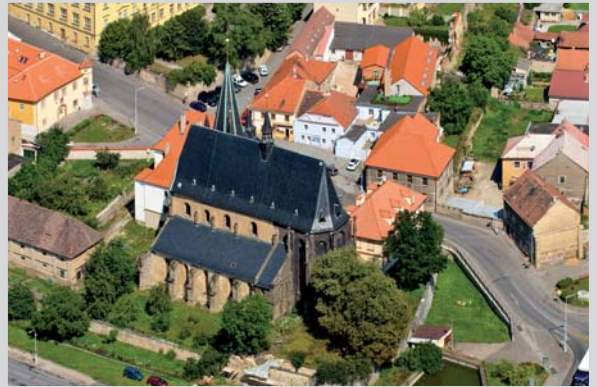
Slaný, The Church of St. Gotthard