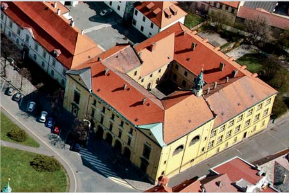
Slaný, The Chapel of Virgin Mary's Assumption